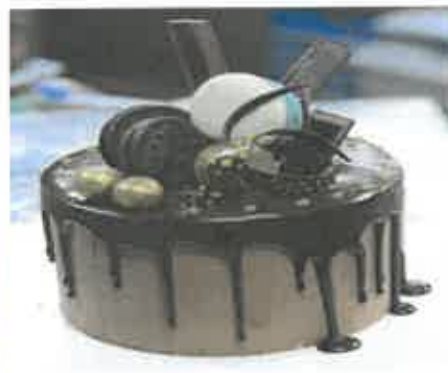
Rocky Road Chocolate Cake

Enrollment: Interested parents please enroll via this e-notice. If the number of enrollment exceeds the quotas. Lots drawing will be conducted. Successful ones will be notified individually for confirmation and fee collection.